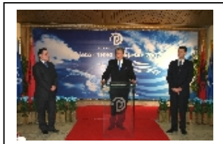
Prime Minister Sali Berisha attended the 17-th anniversary celebrations of foundation of the Democratic Party. In

his greeting message delivered on this occasion, the prime minister said that in this 17-th anniversary of the Democratic Party's foundation, the Albanians commemorate emerge of political pluralism in Albania, as the day marking revival of the freedom and human rights, following the savage years of dictatorship. The prime minister appreciated the date as one of the greatest days of our national history, which produced the first opposition party after half a century of extreme one-party system.