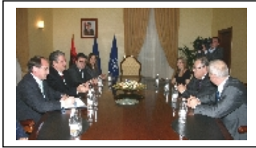
The Prime Minister Sali Berisha met with President of Chamber of Commerce of Greece, also vice President of the European