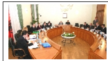
During Dec 12 government meeting, premier Berisha said that the property restitution issue has seen serious problems.

The premier stressed that the concept of distinction between property recognition and its compensation should be clarified, in order to avoid the blocking of construction surfaces and public objects. Among others, the premier stressed that the commission has acted properly in recognizing the right on property to the legal owners, but added that the surface or the object can not be blocked, as long as it holds a public function. Further on, premier Berisha said that if it is necessary, in collaboration with the opposition, the Civil Code would be changed, in order to define that a certain property has been stolen, despite the time of such action.